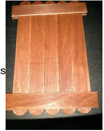
How to finish your craft sticks