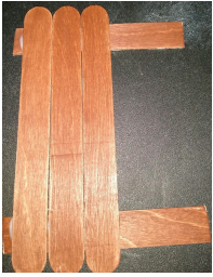
How to start your craft sticks